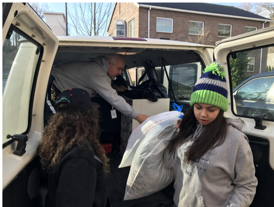
Turning in the clothes collected through the C.A.R.E Team's Winter Clothing Drive.