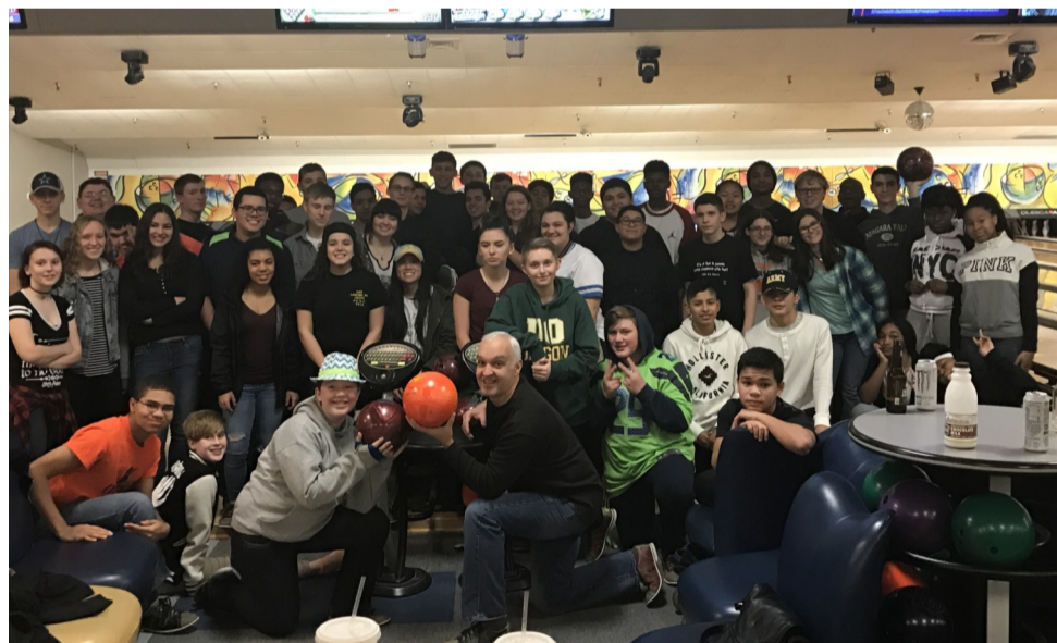
All of our cadets who attended the annual Battalion Bowling Challenge.