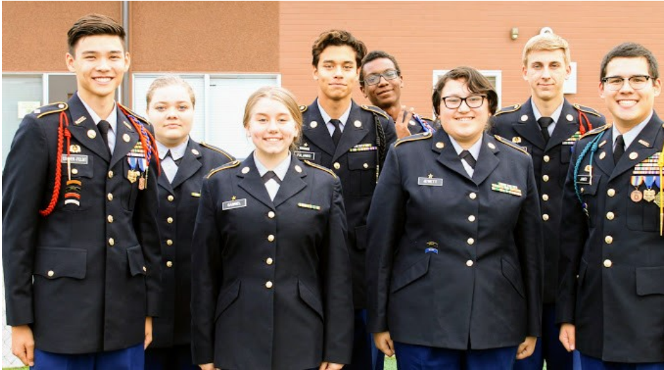
Participants of the NCO of the Quarter Board pose with members of the battalion command group that sat on the board.