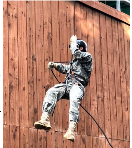
Unidentified person goes down the simulated helicopter rappel side of the tower.

A huge thank you goes out to all the parents who supported our Training at the Tower and at the Rope Bridge Crossing Sites. Without the support of cadet families, the battalion would not be able to conduct the numerous events that we do.