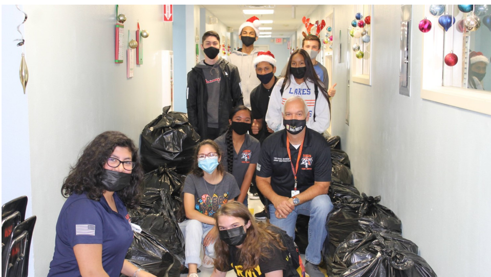
Cadets with all the bags they put together