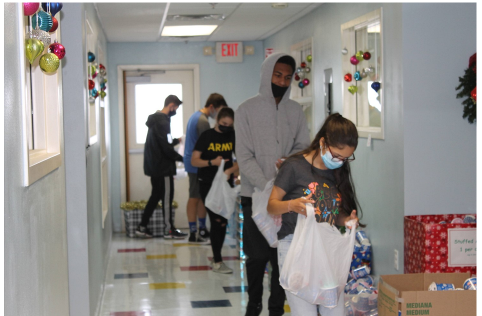
Cadets going down the line while grabbing toys to put in the bag.

Each of our cadets were proud that they were able to help a child celebrate Christmas with joy and knowing that not only it'll give the child happiness but it'll give us happiness too for serving our community.